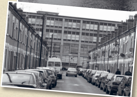
Top: Benjamin Russell & Sons Ltd, c.1960